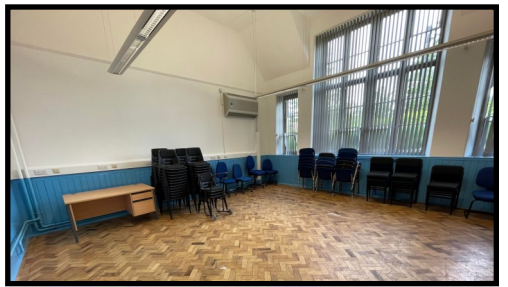
Maximum Capacity: 30 Seated The beautiful parquet floor of the Cursley Room makes this space a great option for dance or exercise workshops. The AV Studio