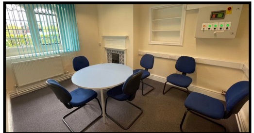
Maximum Capacity: 6 Seated The Patch Meeting Room is an affordable space with availability for meetings & hot-desking.